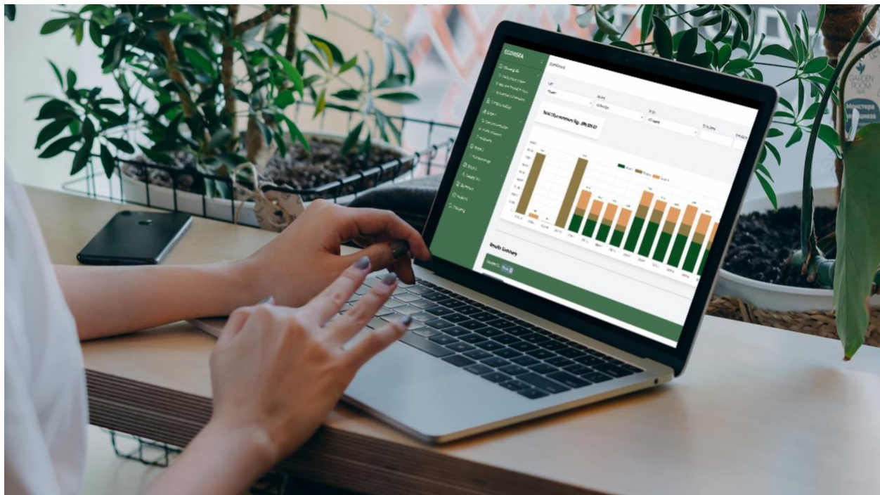
Dashboard of ECOVISEA

The emission factor data used in ECOVISEA is provided by Climatig , a carbon calculation engine. This data upholds the global standard and is compliant with the GHG Protocol and ISO 14067.